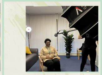
Filming of the new Family Hubs Video